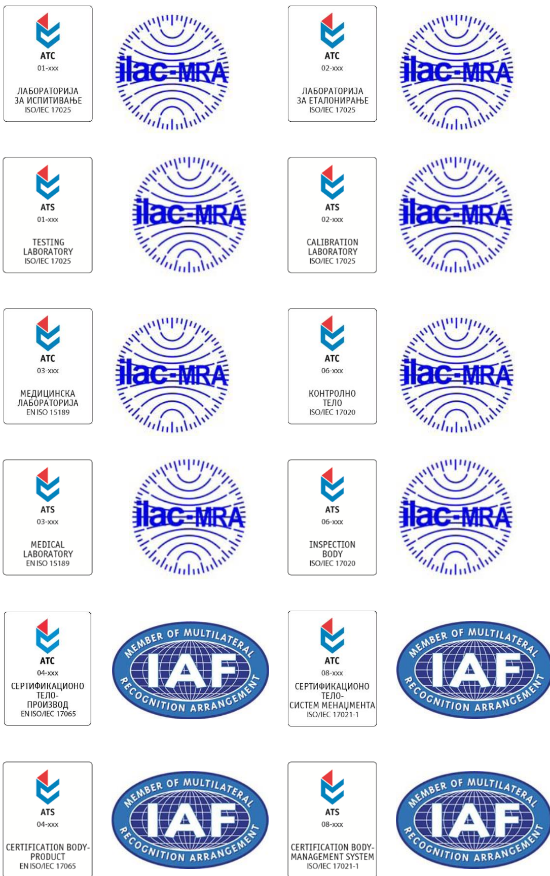
Figure 3: Combined ILAC MRA and IAF MLA Marks